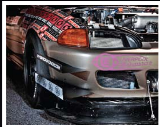
Exterior BYP custom front splitter, canards, rear spoiler brackets & generic wing; Spoon style mirrors, flared, rolled & spaced front fenders; Lexan windows

"The typical modified Honda here in Australia has been built using JDM parts. Over the last couple of years, cars like mine that use American products have demonstrated the capabilities of aftermarket Honda products from the States that cost a fraction of JDM parts. More and more vendors here are stocking aftermarket U.S. products, which is great for the Honda scene in both the U.S. and Australia. I personally like U.S. products because it's easy to call the manufacturer