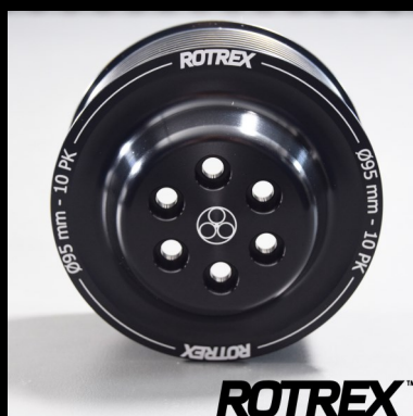
Pulley Ring Ø95 10PK