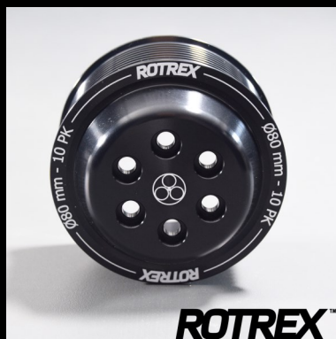
Pulley Ring Ø80 10PK