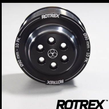
Pulley Ring Ø90 10PK