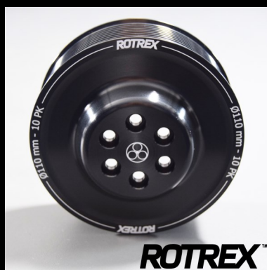
Pulley Ring Ø110 10PK