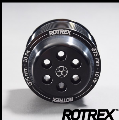
Pulley Ring Ø75 10PK