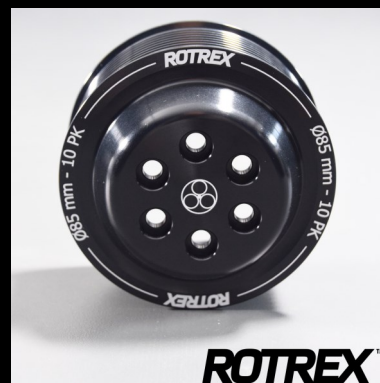
Pulley Ring Ø85 10PK