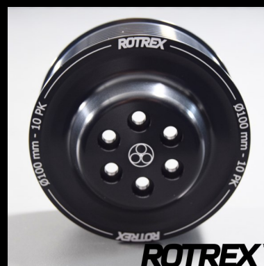
Pulley Ring Ø100 10PK