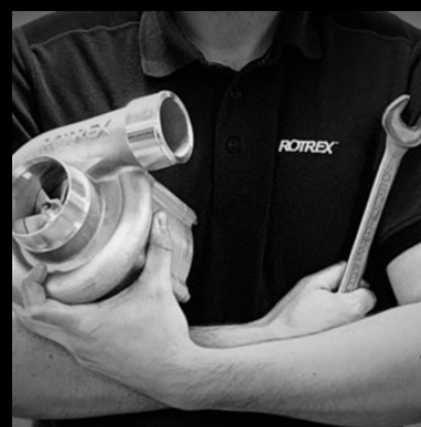
Extended 36-month warranty