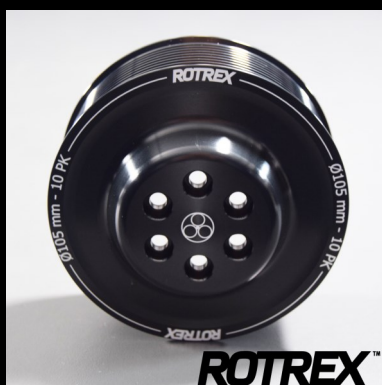
Pulley Ring Ø105 10PK